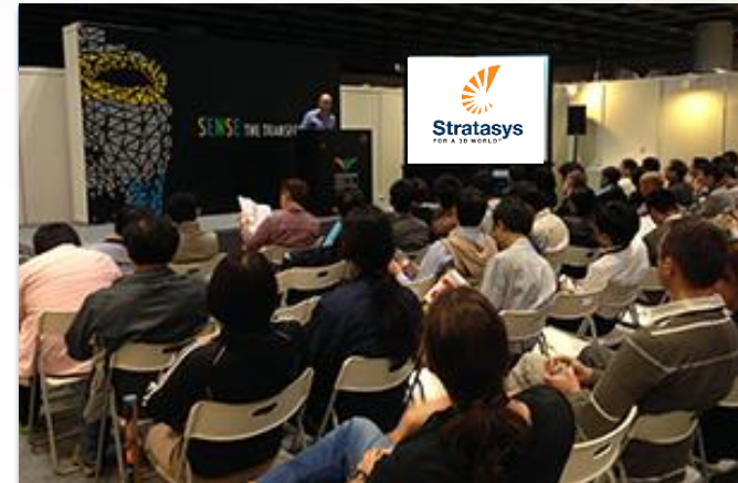
Stratasys at SIGGRAPH Asia 2013

Host your private group meetings and presentation sessions during SIGGRAPH Asia in a more intimate setting. Fee covers one-day cost of the room and marketing of the session in the mobile event program schedule of events and listing on our website. Does not include food and beverage costs, internet connection or AV.