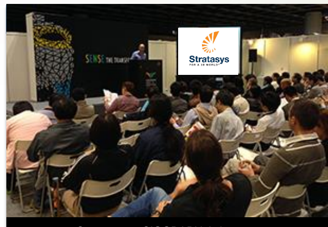
Stratasys at SIGGRAPH Asia 2013

Host your private group meetings and presentation sessions during SIGGRAPH Asia in a more intimate setting. Fee covers one-day cost of the room and marketing of the session in the mobile event program schedule of events and listing on our website. Does not include food and beverage costs, internet connection or AV.